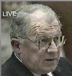
F. Lee Baily